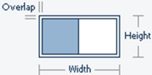
Side Sliding Storm Window

Specify screen left or right from outside